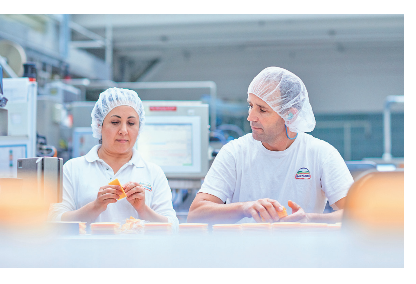
3 Dealing with employees and social partners