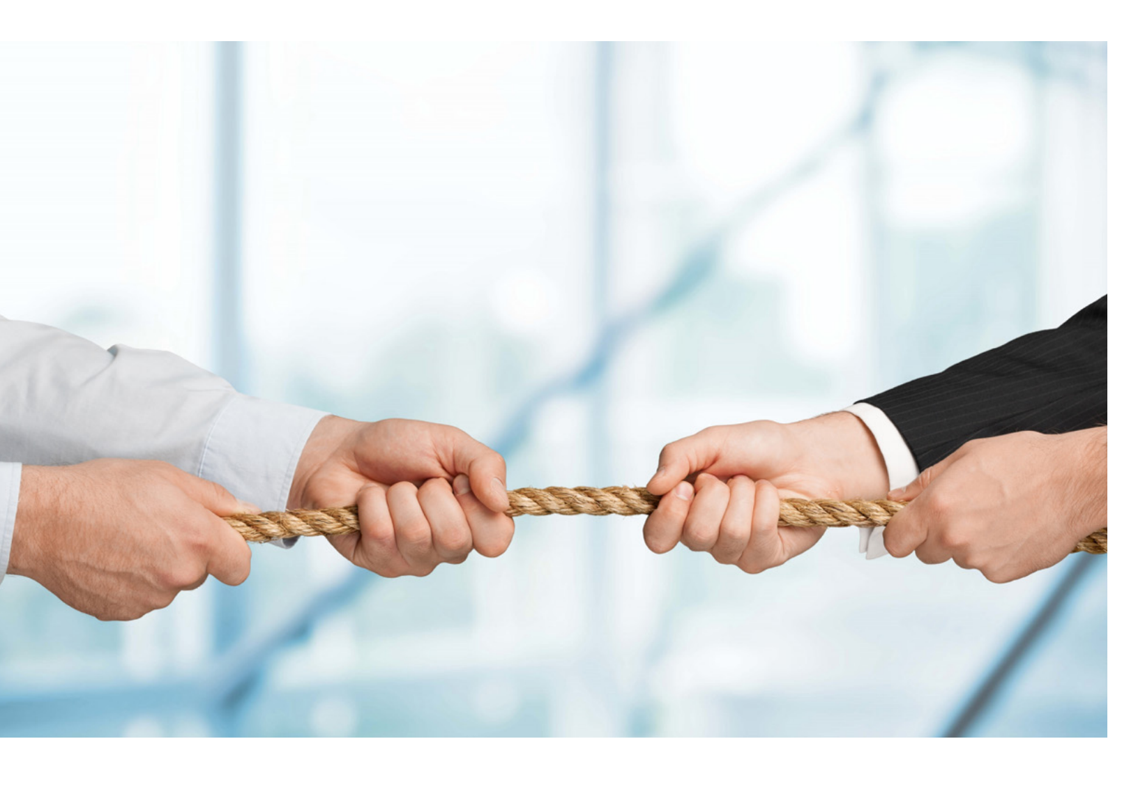
4 Conflicts of interest

In the context of a target-orientated and results-orientated approach, business decisions are to be made to the best of our knowledge and belief exclusively on the basis of factual criteria; by our employees always primarily in the interests of Hochland, while also taking into account the legitimate interests of our business partners. It is not permitted for an employee to pursue their own interests to the detriment of Hochland. Every employee is therefore obligated to disclose any possible conflicts of interest to his/her immediate or next higher superior. The superior checks whether these facts prevent the employee from performing his or her duties properly, whether and how they can be resolved and how to proceed. The result of the examination is to be made transparent to the employee concerned. The right to involve employee representatives exists independently of this.